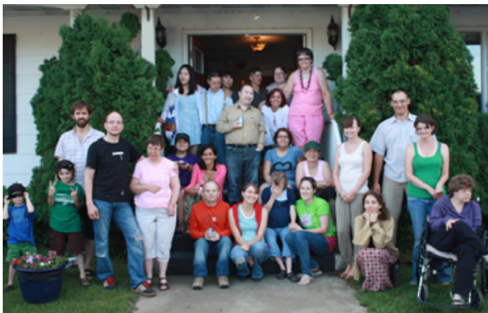
In July we spent a week of community holidays in and around Saskatoon, and we were joined at different times by holiday groups from Lethbridge, Edmonton, and Winnipeg. On July 26th, we all got together for a BBQ at Christopher House.

Five community members from L'Arche Saskatoon took part in the Calgary leg of the pilgrimage, and nine participated in the final stage in Winnipeg. As we are the youngest community in our region—we are coming up to our fourth birthday in February—it was a wonderful opportunity for us to grow in our understanding of L'Arche and to deepen our relationships with other communities who are on this same journey with us.